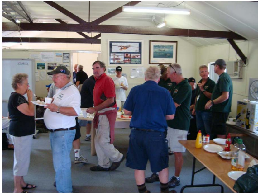
CFML Volunteers and guests enjoy fine food and a chat