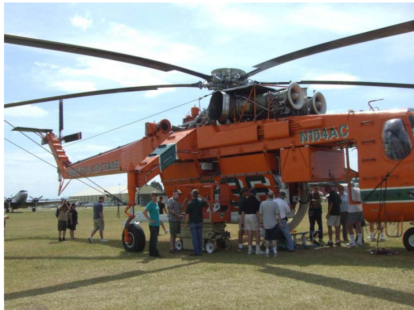
Getting a look over the Erickson Air-cranes