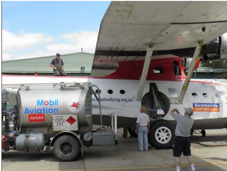
Fill 'er up!