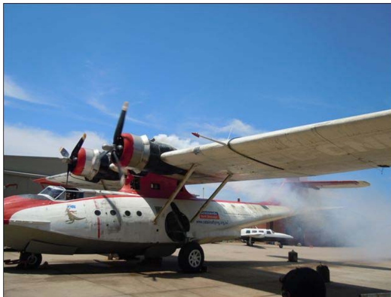
The engine run